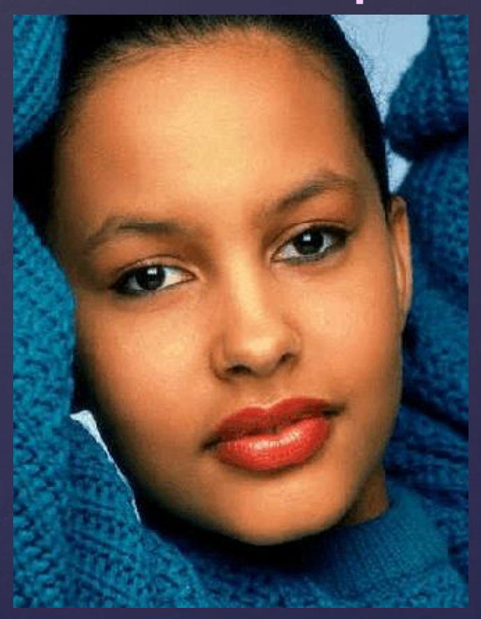
Wisdom Principle 4

"Honey, I don't need you to be me because God made me who I am."